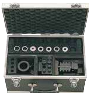
Plastic case for BLS tools and dies (Accessories)