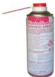
Spray for cutting and punching