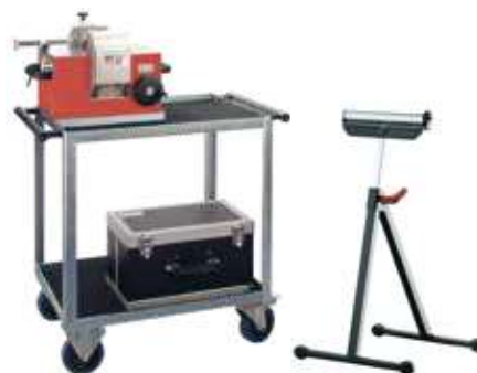
Trolley/Trestle for positioning the Bus Bar Work Station in ergonomic high