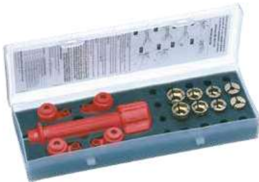
Model Version A