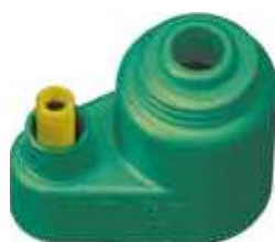
Insulated clamp D4 mm 2130 004