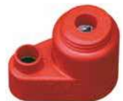
Insulated D8 mm clamp - 2202 1

Allows adjustment of the connection torque of 10Nm via a torque wrench