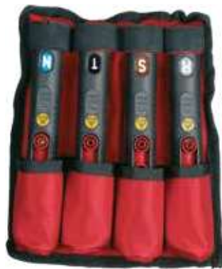
Sturdy case - 2103 0