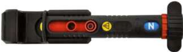
Clamp 70 - 240 mm 2 - 2103 4