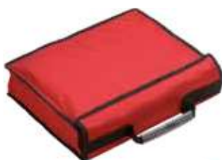
Strudy case - AB4712