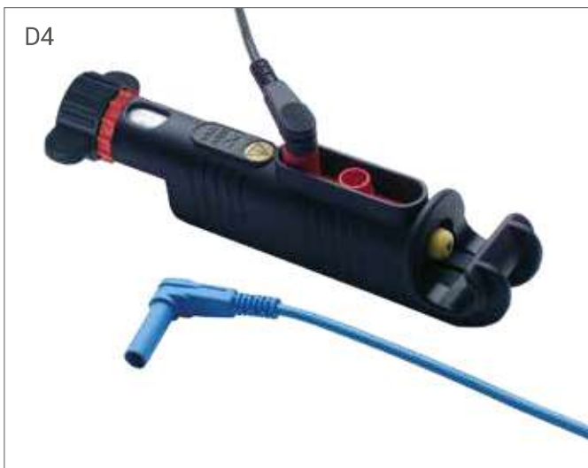
Socket D4 mm for current take-off and electric measurements