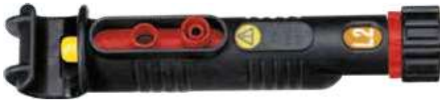
Clamp 10 - 95 mm 2 - 2103 1