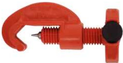
Clamp 10 - 95 mm 2 - 2105 0