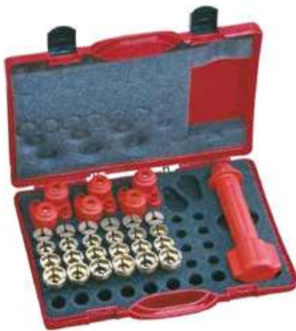
Model Version B