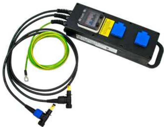
A= with pin