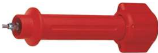
Insulated grip D8 mm - 2201 1