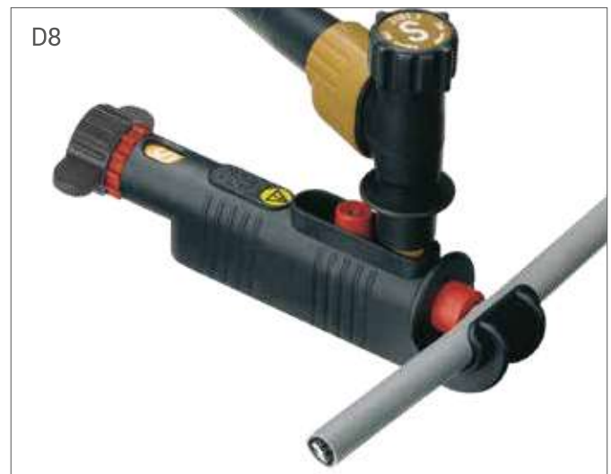
Socket D8 mm with D8 Intercable plug for shunts and current take-off