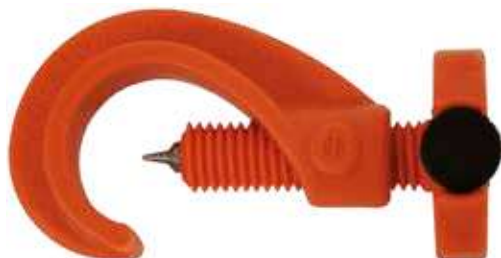
Clamp 50 - 300 mm 2 - 2105 1